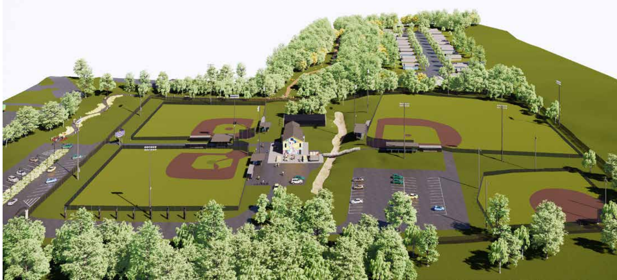
Parkwood Community Club renovation vision and park trailhead.