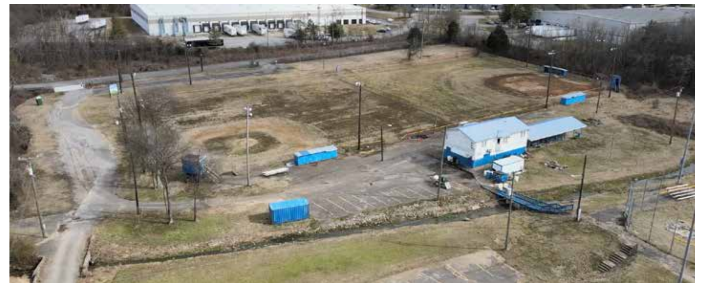
Current view of Parkwood Community ballfield, located at 3022 Aldrich Lane, Nashville